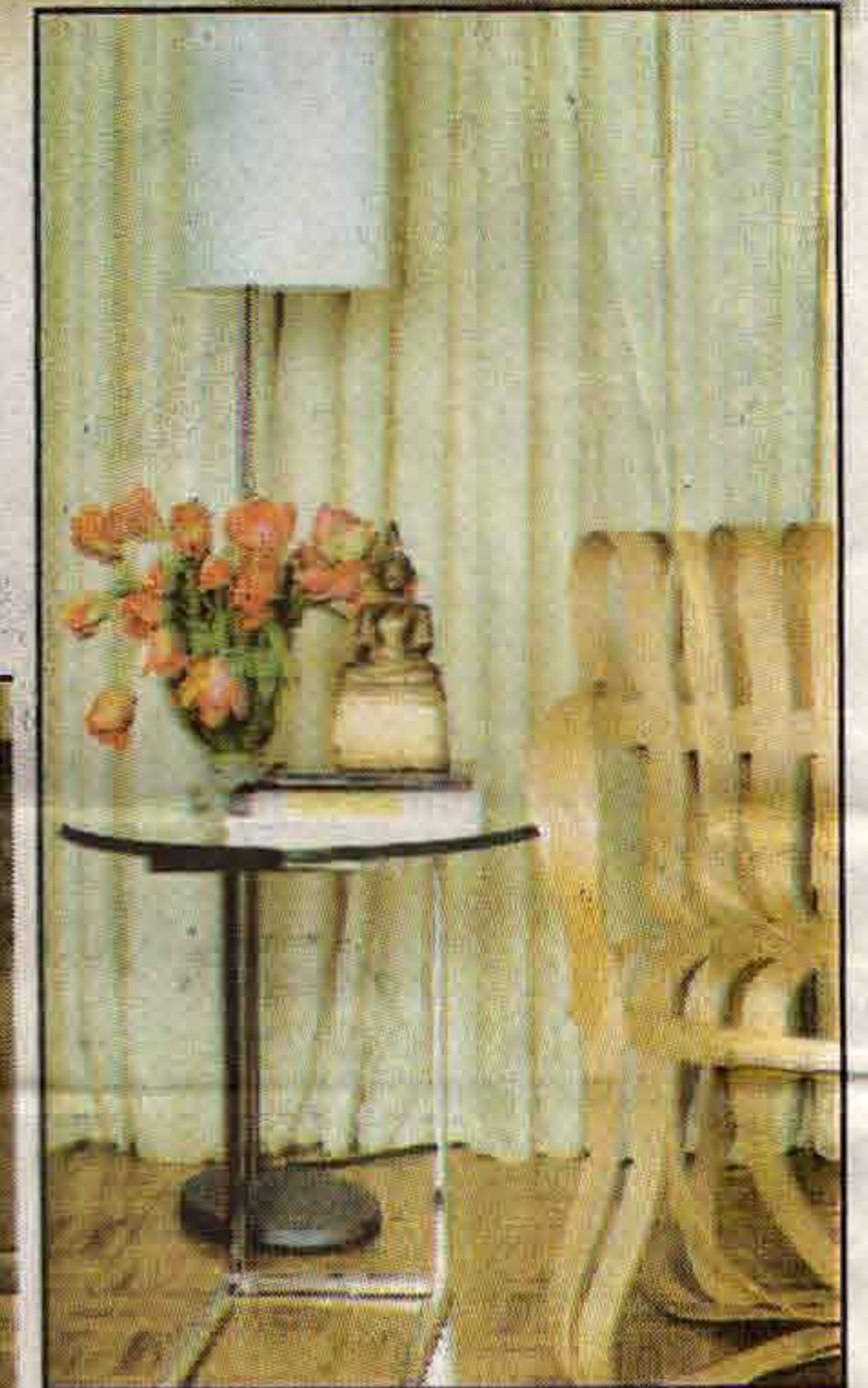
A room with a bended wooden chair (right) and an old antique Buddha

JT Designs Studio is located at GF B&M Building, Aguirre St., Legaspi Village, Makati City. For more information, log on to www.tesalonadesigns.com or call 817 8518.