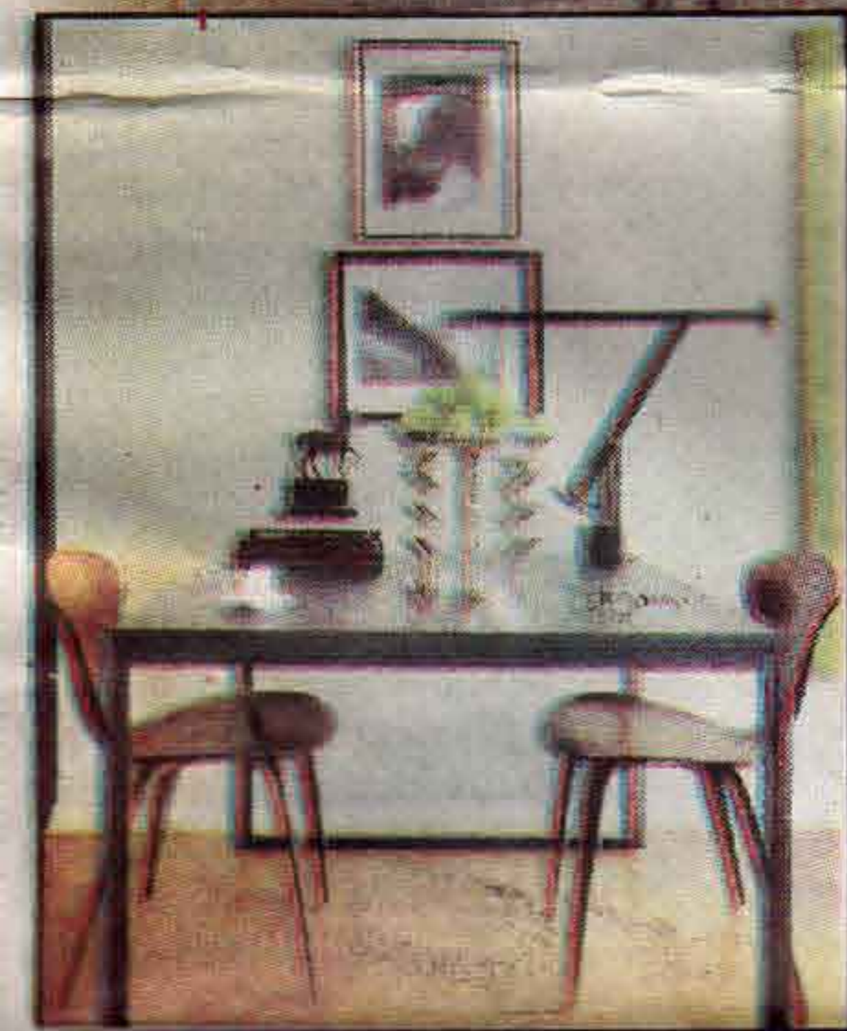
Dining table for two

N EW York-trained Filipino design consultant Joey Tesalona comes home for good to offer fresh, contemporary interior design options. He recently opened JT Designs Studio in Makati. It specializes in interior designs and offers consultations in exhibition and retail design and visuals.